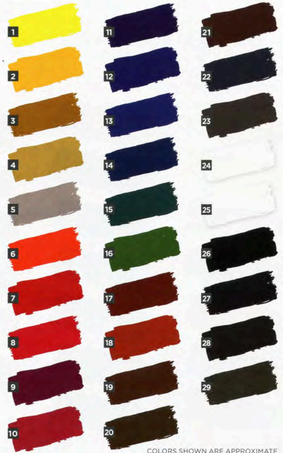
COLORS SHOWN ARE APPROXIMATE